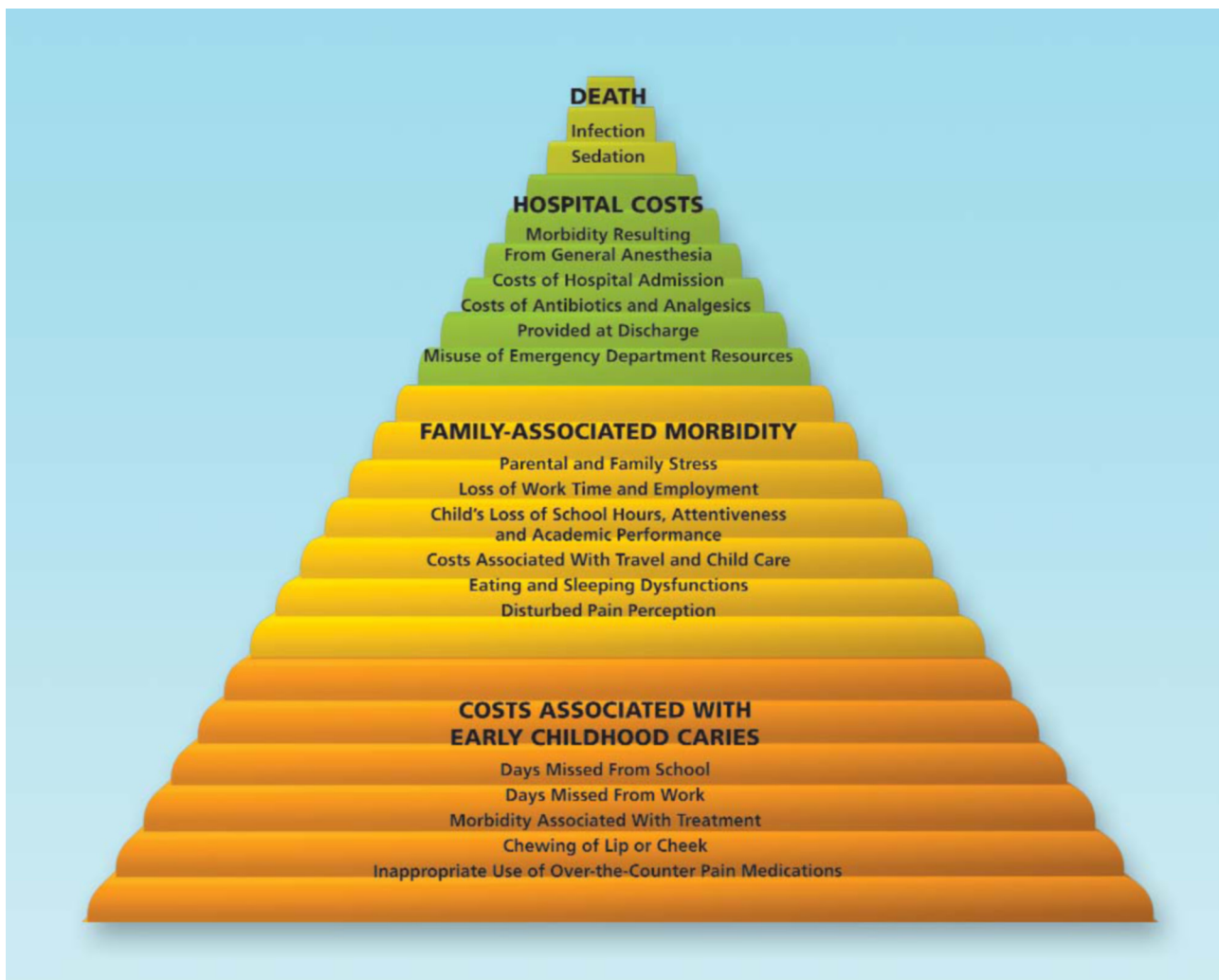
Figure 3. A proposed early childhood caries morbidity and mortality pyramid.

and failure to thrive—a condition of poor growth in young children—in a cohort of low-income children. Body measurements and blood test results indicative of malnourishment are significantly associated with severe ECC and suggest iron-deficiency anemia. 39 These reports and others stimulated interest in the effects of ECC and its treatment on child growth, looking at factors such as dysfunctions in eating, sleeping, mood and attention. Knowledge of the impact of ECC on the development of the child in physical, emotional and intellectual terms is fragmented. Episodic pain from dental caries is well-established as a constant finding, even from an early age, affecting up to 20 percent of preschoolers. 37,39-41